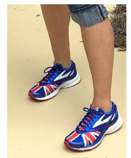
A 'Brit' in the crowd didn't let us forget why we celebrate the 4th of July.