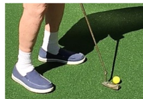
The Putting Green was quickly christened after the ribbon cutting.