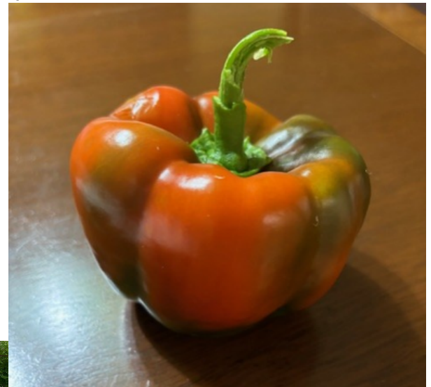
A Pepper from Chick Williams' Garden