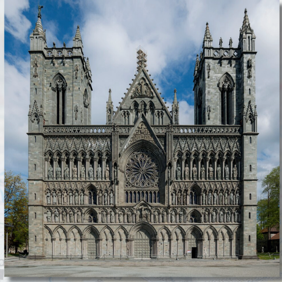
The West view of Nidaros Cathedral. Restored 1905-1983

NIDAROS CATHEDRAL, Trondheim, Norway: Built over the tomb of St. Olav who brought Christianity to Norway. Construction started in 1070 and due to fires, wars, and problems such as black death killed all priests including the archbishop in 1349. Construction continues today. Nidaros is the northernmost Gothic cathedral, and all kings of Norway are coronated in Nidaros. We have visited Nidaros several times.