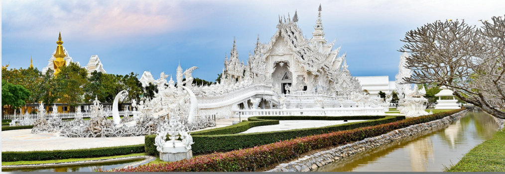
Wat Rong Khun (Thai: วัดร่องขุ่น), better known as the White Temple, is a Buddhist temple in Pa O Don Chai, Mueang District, Chiang Rai province, Thailand.

WAT RONG KHUN (White Temple), Chiang Rai, Thailand: Construction continues and more buildings are planned until 2070. This temple was visited in 2001 along with the elephant camp in Chiang Mai, the floating markets, and a boat ride on the River Kwai.