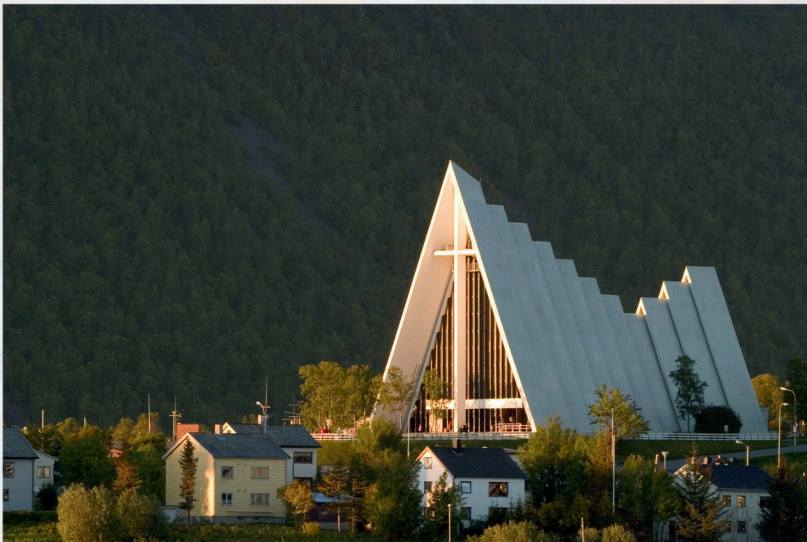
The striking Arctic Cathedral with surroundings in Tromsø , illuminated by the midnight sun with a mountain backdrop. Picture is taken at 20 minutes past midnight.

TROMSDALEN CHURCH, (Arctic Cathedral), Tromsø, Norway: Built in 1965 and located above the Arctic Circle. Trondheim and Tromsø are port calls for the Hurtigruten ships (combination cruise passenger/.freight) that make 34 port calls along the Norway coast from Bergen to Kirkenes. A unique experience while sailing above the arctic circle the sun doesn't set in June and July or doesn't rise above the horizon in December and January.